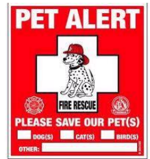
Home pet alert notice