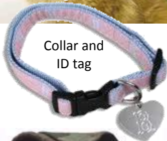
Collar and ID tag