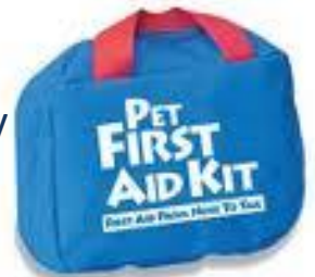
First Aid Kit & Medications