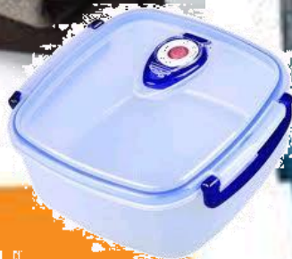
Container for food/water dishes