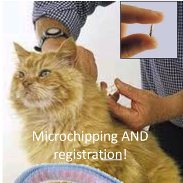
Microchipping AND registration!