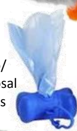
Poo/ Disposal Bags