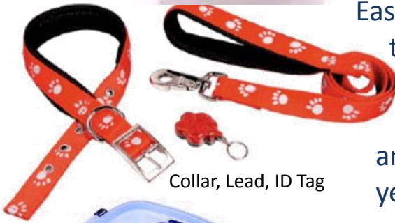
Collar, Lead, ID Tag

And as with our own emergency supplies, remember to rotate food, and change water at least once a year.