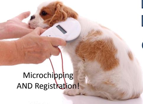
Microchipping AND Registration!