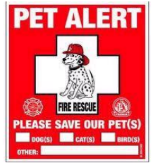
Home pet alert notice

Organising these few things into a bag to be kept with your crate now will help reduce time and stress in the event of an emergency or evacuation.