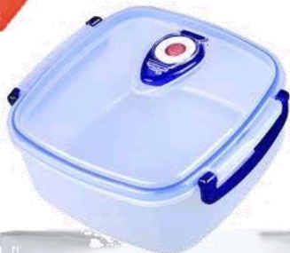
Container for food/water dishes