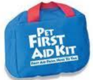
First Aid Kit & Medications

Organising these few things into a bag to be kept with your crate now will help reduce time and stress in the event of an emergency or evacuation.